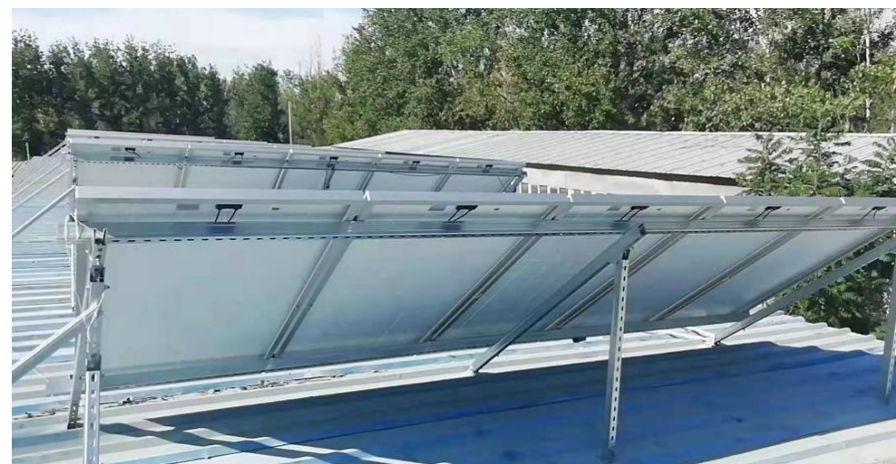
Beijing 30kW photovoltaic off-grid