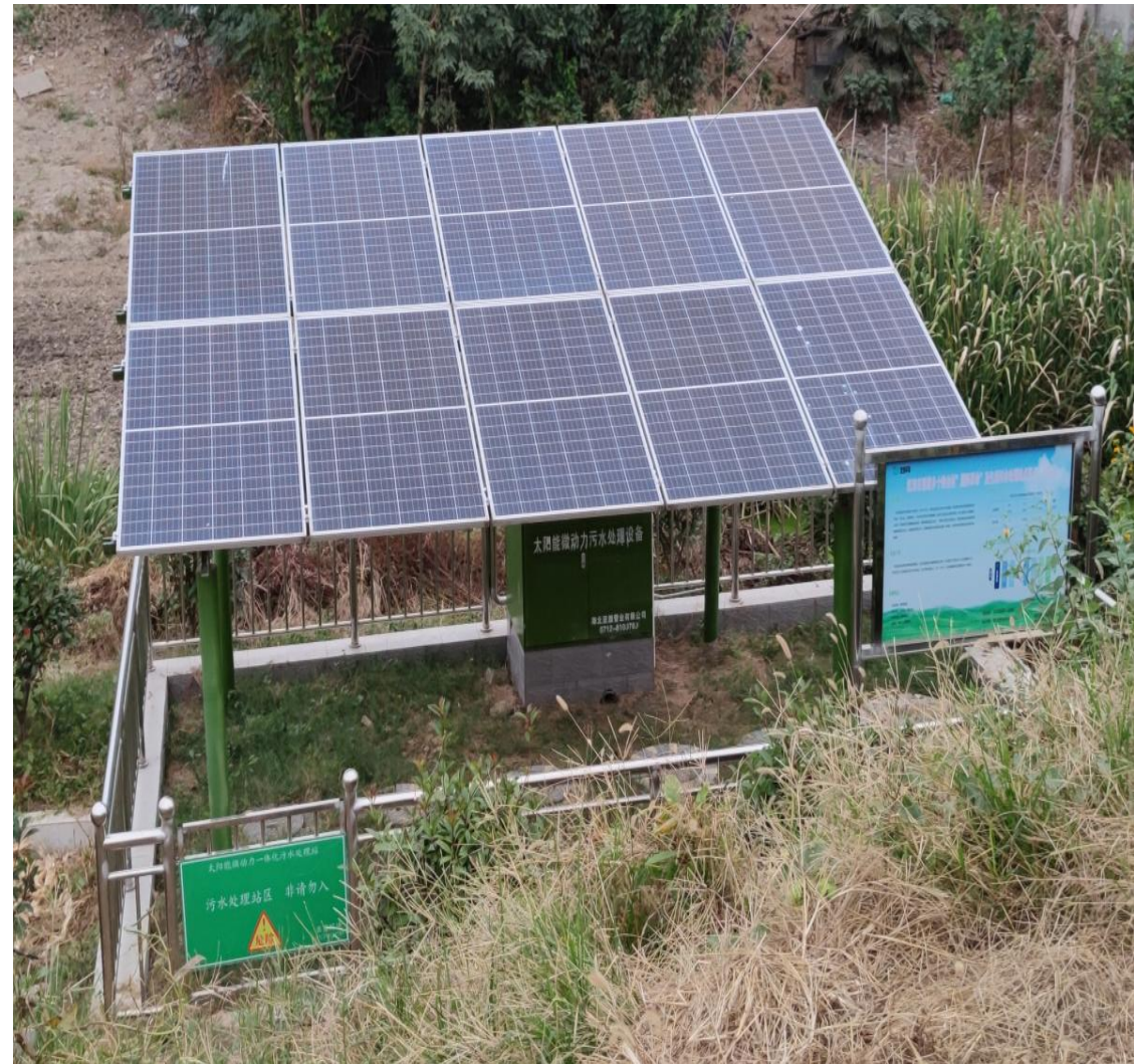
Photovoltaic monitoring in Xigaze, Xizang