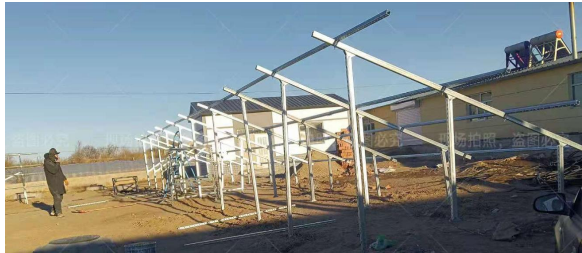
240kW photovoltaic toilet in Horqin, Inner Mongolia