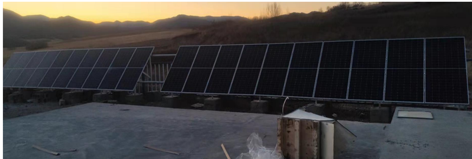
10kW photovoltaic off-grid in Hulunbuir, Inner Mongolia