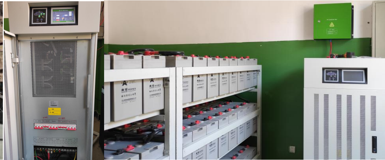
Yushu 30kW photovoltaic off-grid