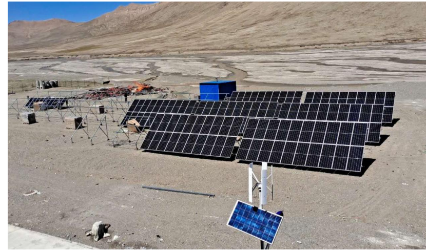
Qinghai 300kW photovoltaic off-grid